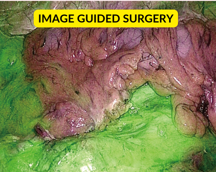
IMAGE GUIDED SURGERY

Empowering Hope, Embracing Strength: Cancer Care, Every Step of the Way